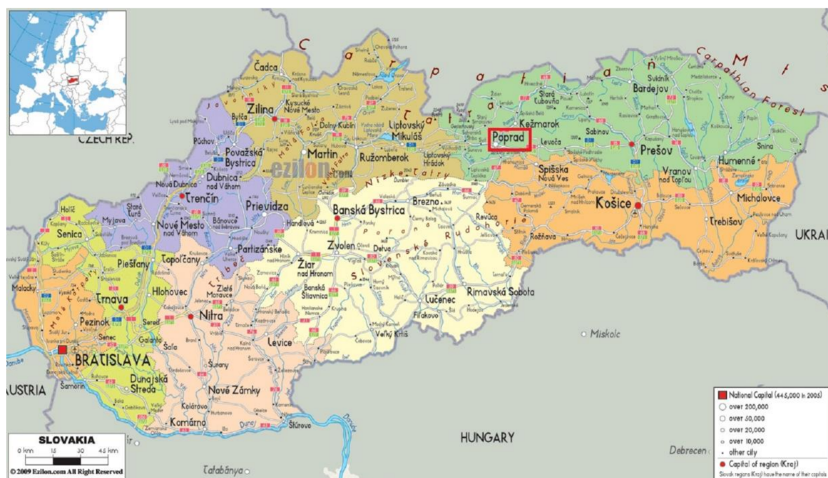
Figure 1. Slovakia, showing the city of Poprad (red rectangle)

In line with Radicova [54], we described the three groups as dwellers in integrated or separated communities, or segregated settlements. Regarding ethnicity, we worked with the Rumungre Roma living in the east of Slovakia [55]. We used random sampling with no defined criteria. In our field research conducted in 2012–2013, we interviewed more than 50 people, conducted two focus groups, made more than 1700 min of recordings, and took more than 250 photographs. At the beginning of the research, local intermediaries introduced us to the families who provided us with a place to stay. The interviews on nutrition patterns were conducted in family settings. Then, we visited randomly chosen houses and huts. Some people even sought us out and wanted to share their everyday reality. The semi-structured observations and interviews took place in the natural environment of the dwellers in the three types of settlements. The data were collected in three localities of the Poprad district: a segregated settlement, a separated concentration, and the town itself, where the Roma live integrated among the majority of the population (Figures 1 and 2).