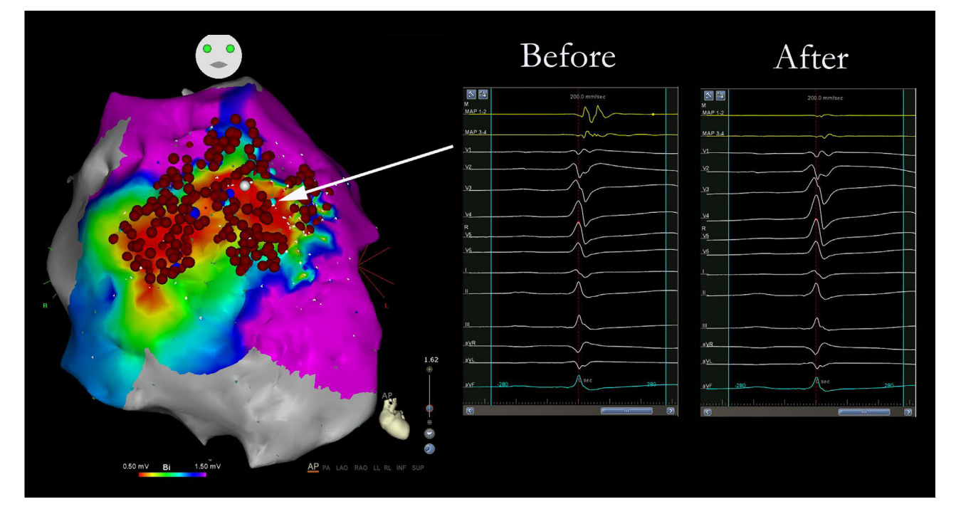
Figure 3 Anteroposterior view of the right ventricle epicardial voltage map after radiofrequency (RF) ablation. Electrograms displayed before and after RF delivery.