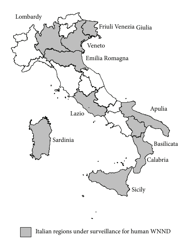
FIGURE 3: Regions under surveillance for human WNND, Italy 2013.

Between the first occurrence of WND in Italy in 1998 and its reemergence in 2008, WND was considered an exotic disease for the Italian territory and the main objective of the surveillance activities in place at that time was to evaluate the possible reintroduction of the virus. In this context, the data collected by the national system for the notification of animal diseases (SIMAN) were useful for a rapid epidemiological evaluation, to define areas at risk for human transmission and to facilitate the implementation of effective and prompt control measures.