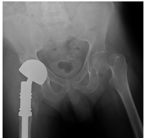
Fig. 3. Left subcapital femoral neck fracture after a low-energy trauma. In the contralateral hip, the silver-coated proximal femur megaprosthesis using a cementless stem with a dual mobility cup (MUTARS®; Implantcast GmbH, Germany) is correctly positioned.

approach, using a cementless stem and DM cup (Fig. 4). Two months after surgery, the patient suffered his first posterior dislocation in the left primary arthroplasty. It was resolved non-operatively.