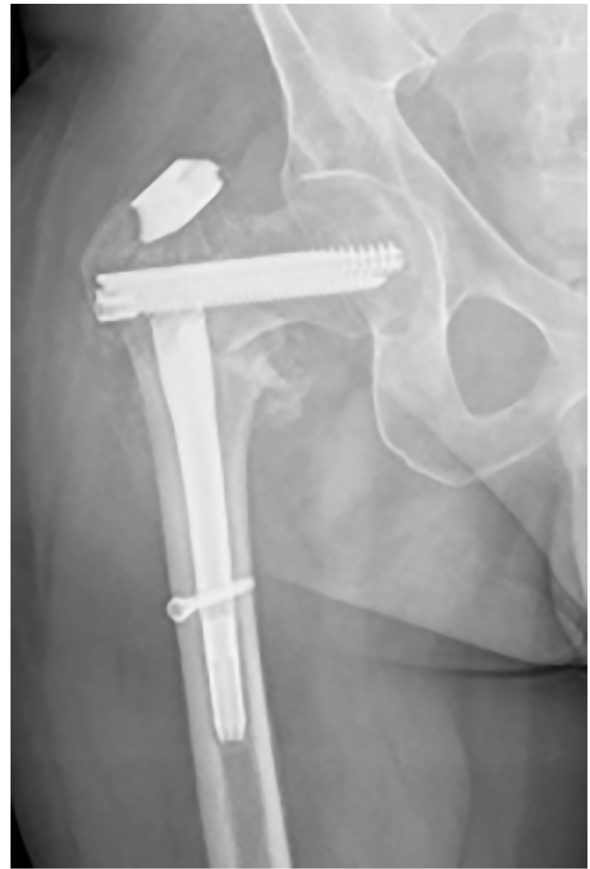
Fig. 2. X-ray images demonstrating a fatigue fracture. It was presumably caused by chronic infection and fracture non-union.

One year later, the patient appeared with a posterior hip arthroplasty dislocation, which was treated with a closed reduction. During hospitalization, he suffered a fall from his own height and presented a contralateral subcapital femoral neck fracture (Fig. 3). A THA (H-Max®; Lima, Italy) was implanted through a posterior