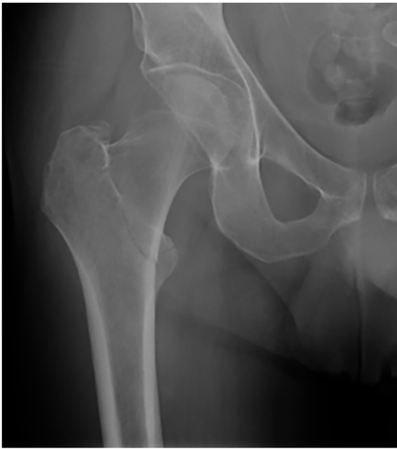
Fig. 1. Nondisplaced intertrochanteric right fracture, subsequent to a low-energy trauma.

(myoclonus) due to HE. We discuss the clinical relevance of this novel case.