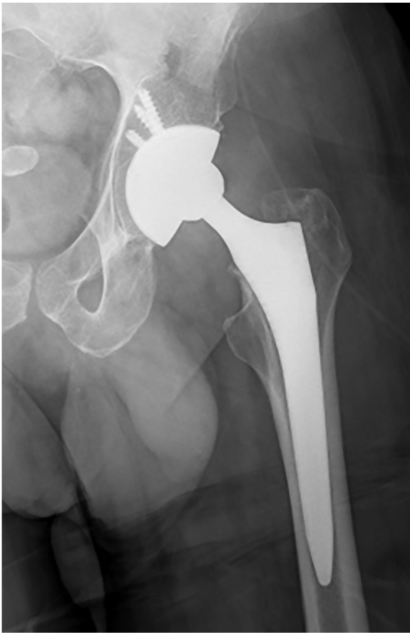
Fig. 4. The subcapital femoral neck fracture has been operated through a THA (H-Max®; Lima, Italy), using a cementless stem and dual mobility cup.