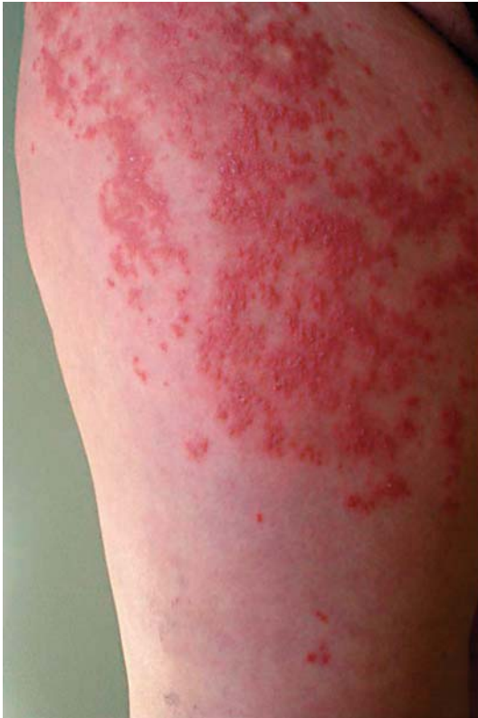
Fig. 1. Linear arrangement of psoriatic lesions on the proximal third of the thigh.