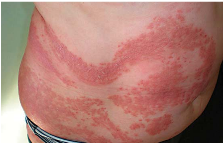
Fig. 2. Arrangement of lesions in the abdominal region: transverse 'S'-shaped lines.