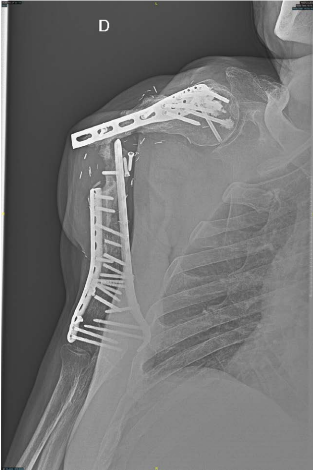
Fig. 1. Recalcitrant pseudoarthrosis of the middle third of the shaft of the humerus (1b).