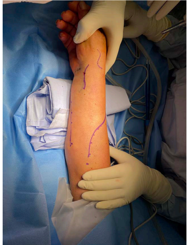
Fig. 2. Different surgical areas approached, a total of five, are sequentially infiltrated to perform the surgical transfer technique.

Finally, 30 ml was infiltrated in the volar and radial border of the wrist where the palmaris longus (PL) to EPL transfer was performed.