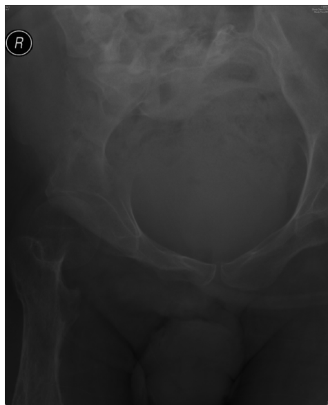
Figure 1 X-ray of pelvis, taken on 11 November 2009, showed soft tissue shadow of distended urinary bladder in pelvis.

When the balloon of Foley catheter was deflated, this patient developed massive bleeding per urethra. A sterile 22 French Foley catheter was inserted through suprapubic track. The catheter drained urine, which was heavily stained with blood. He was admitted to spinal unit. This