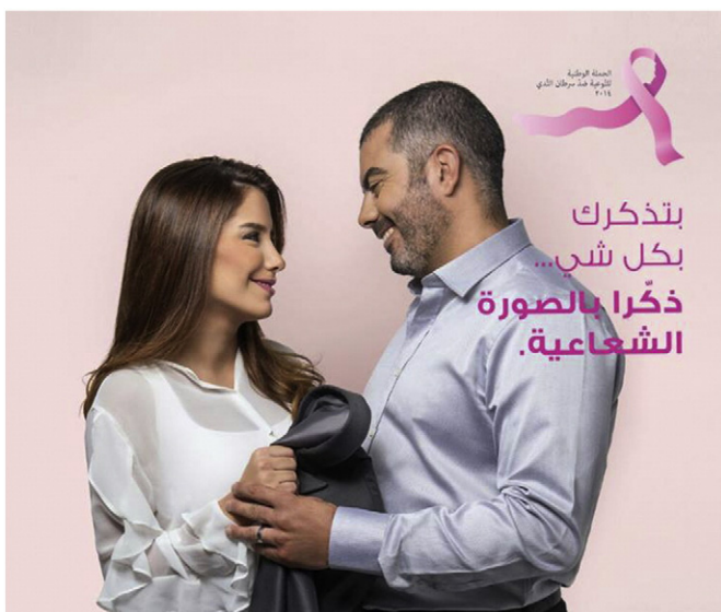
Fig. 2. Advertisement message of the National Breast Cancer Awareness Campaign 2014: “She reminds you of everything ... Remind her of the mammography.” (Retrieved from the Facebook page of the campaign “Breast Cancer Lebanon”, on December 22, 2015)

Selection bias might have occurred at different levels of this survey. Non-participants are believed to have higher mammography use than participants (Dupont et al., 2008), which may mean that all levels of