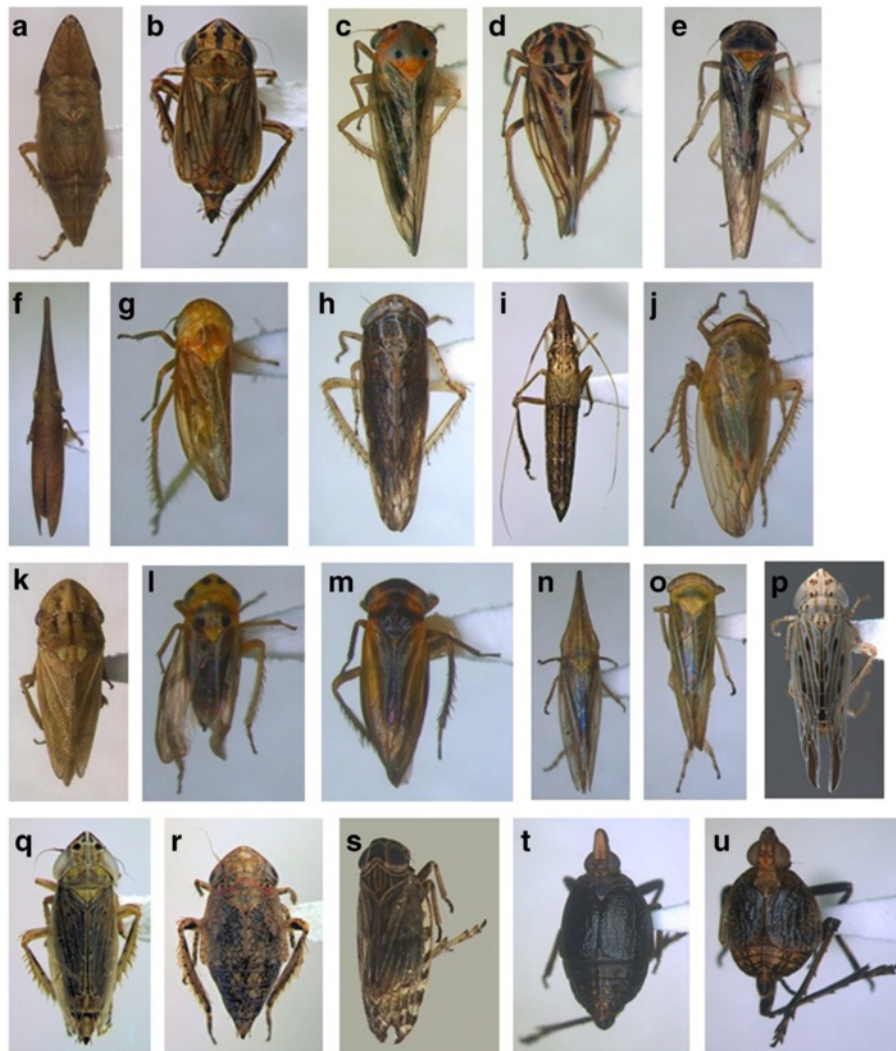
Figure 4 Leafhoppers and planthoppers collected on the Kamdebooberge (average length of specimens 5 mm): a Afralycisca umbrina , b n.gen & sp.1, Athysanini, c Austroagallia sp1, d Austroagallia sp2, e Balclutha sp., f Cephalelus attenuatus , g Chlorita cylindrica , h Circulifer struthiola , i Drakensbergena gigascutica , j Exitianus taeniaticeps , k Hangklippia signata , l Iseza sp., m Molopopterus sp., n Paradorydium sp., o Tetartostylus sp., p Teinopterus mikrophallus , q Tetramelasma litopyx , r Tzitzikamaia sp., s Cixiidae, t Menches atropos , u M. decuma .