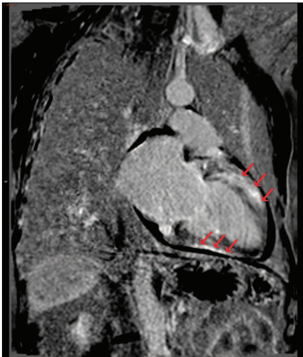
Figure 2. Representative cardiac magnetic resonance (CMR) image showing diffuse late gadolinium enhancement (LGE) in the left ventricle (red arrows), which implied diffuse myocardial damage in the patient.

As thrombosis is a major complication of AF, anticoagulation therapy is essential to reduce the risk of stroke in AF patients. [5,6] Previously, the RELY study [7] and ROCKET-AF study [8] demonstrated the efficacy of the NOACs dabigatran and rivaroxaban, respectively, for thrombosis treatment related to AF. Moreover, Lip et al [9] recently reported that rivaroxaban can resolve atrial thrombi in up to 62.5% of the AF patients. Moreover, NOACs have proven to be as efficacious as warfarin in stroke prevention in AF patients, requiring less frequent monitoring of the coagulation index or adjustment of dose and making their use more convenient for physicians. [8] In spite of the established benefits of NOAC treatment, it is unknown whether differences in the efficacy of these medications exist among AF patients, which would have clinical implications for the prescription and treatment success.