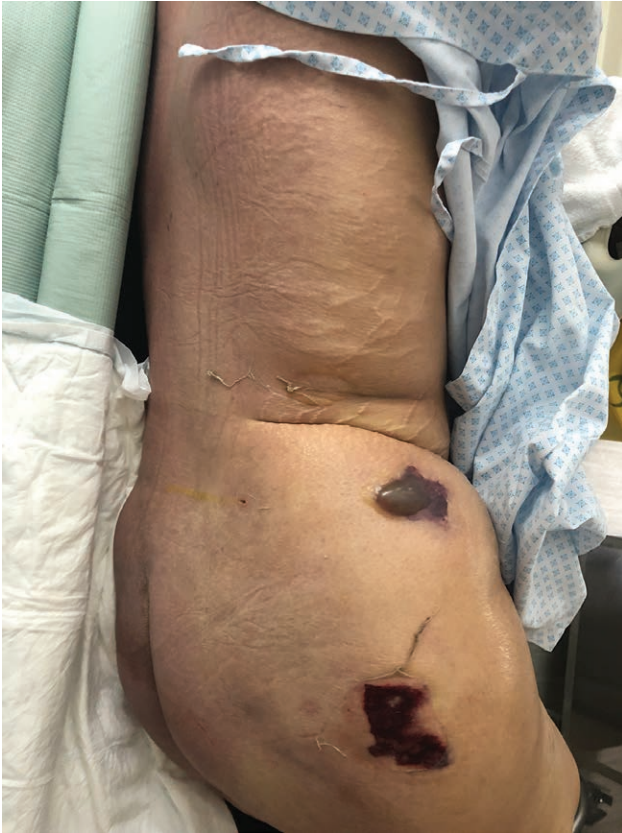
Fig. 1. Photograph showing the patient's condition preoperatively. Note the subtlety of the infection signs being limited to erythema and a small bullous.