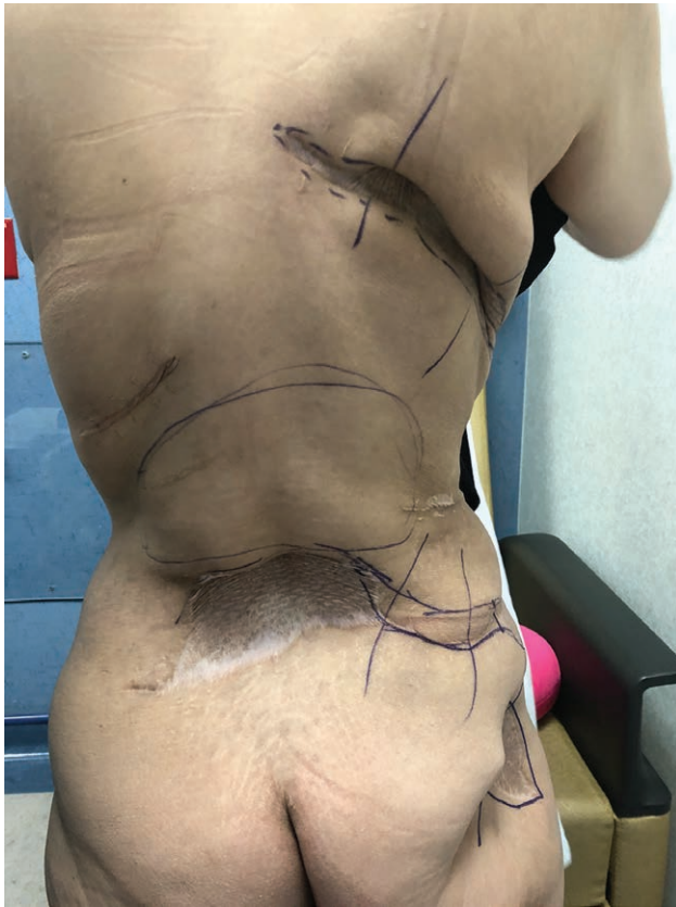
Fig. 3. This photograph was taken more than 1.5 years from the skin grafting. As demonstrated, the plan was to excise the scars and skin graft, reapproximate as much as possible, and place a tissue expander in case primary closure was inapplicable.