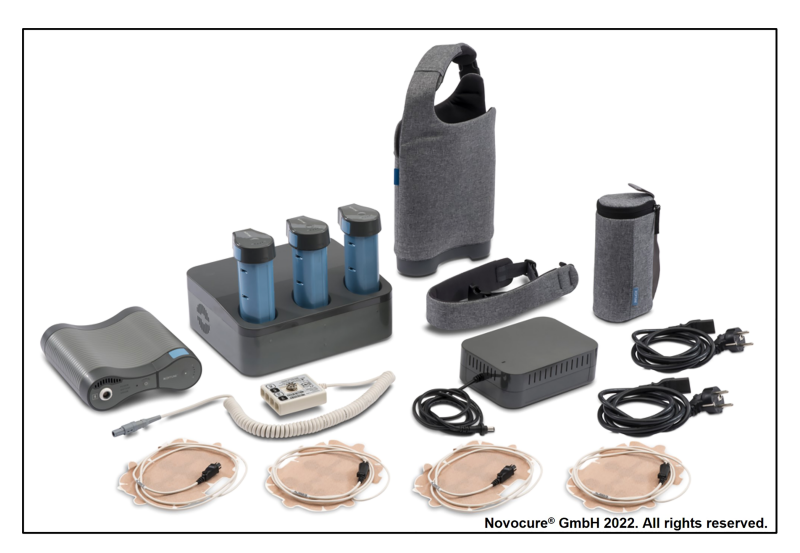
FIGURE 1 The portable NovoTTF-200A System delivers TTFields using four skin-placed arrays.

EF-11 was a prospective, randomized controlled clinical study evaluating the efficacy and safety of TTFields monotherapy versus physician's choice of best standard of care (BSC) in adult patients with rGBM. TTFields monotherapy showed clinical benefit comparable to chemotherapy in patients with rGBM. Median survival with TTFields therapy versus BSC was 6.6 versus 6.0 months (hazard ratio [HR], 0.86 [95%] confidence interval (CI): 0.66-1.12]; p = 0.27), 1-year survival rate was 20% versus 20%, and progression-free survival (PFS) rates at 6 months were 21.4% and 15.1% (p = 0.13), respectively. TTFields therapy-related adverse events (AEs) included localized mild and moderate skin rash beneath the arrays. Patients in the group treated with TTFields therapy experienced fewer treatment-related AEs and systemic AEs than those in the BSC group. Quality of life (QoL) favored the use of TTFields therapy over BSC in the cognitive and emotional function domains, with no significant differences between TTFields therapy and BSC in the global health and social functioning domains. Furthermore, symptom scale analysis regarding treatment-associated AEs - appetite loss, diarrhea,