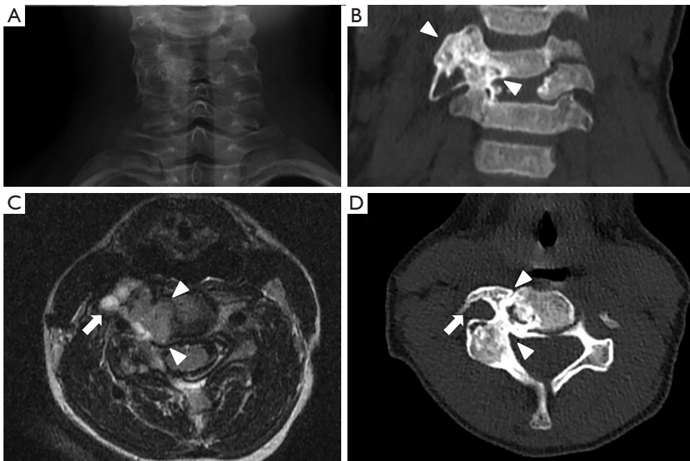
Figure 3 Follow-up imaging 21 months (conventional X-ray) (A) and 10 months (CT scan, T2-weighted MRI sequence) (B-D) after the second and final round of CYOA therapy. We demonstrate an almost complete sclerosis of the medial aspect of the tumor contacting the spinal cord and the C5–C6 nerve roots (arrowheads). A small remnant in the lateral aspect of the transverse process is observed (arrows). CT, computed tomography; MRI, magnetic resonance imaging; CYOA, image-guided percutaneous cryoablation.

of a 100 mg/5 mL solution of doxycycline was used before CYOA at the edge and inside that portion of the lesion, allowing a more aggressive and complete CYOA procedure which was carried out during the same procedure. The patient remained under observation and was discharged the following day without adverse events.