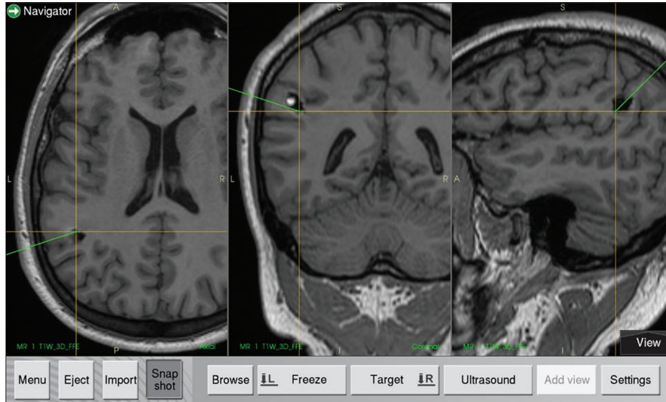
Figure 2: Neuronavigation location of the target.