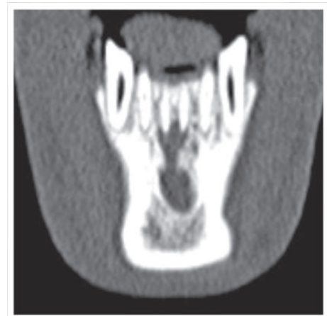
FIGURE 3: CT Image showing Dumbbell shape periapical lesion in relation to Mandibular central incisors.

a day for five days and combination of 100 mg of aceclofenac and 15 mg of serratiopeptidase twice a day for five days. One week later, the patient was asymptomatic, obturation was done with cold lateral compaction technique, and the access cavity was restored with composite resin. Before performing the endodontic surgery, the patient was advised to undergo blood investigations to rule out bleeding disorders. Complete blood picture and coagulation studies report were normal. The general health condition of the patient before the surgery was good and he fell under ASA I, according to "ASA" physical status classification system.