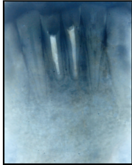
FIGURE 4: Postoperative radiograph after one year showing healing.

The differentiation of periapical cysts and granulomas is very difficult by the traditional radiographs. By the radiographs, only the mesiodistal extent of the pathology can be