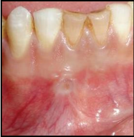
FIGURE 1: Sinus opening on the labial aspect of Mandibular right central incisors.