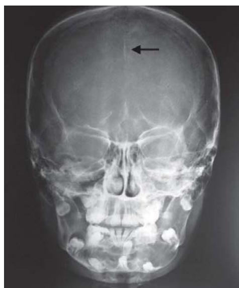
Fig. 6: AP view of skull showing minor degree of falx cerebri calcification