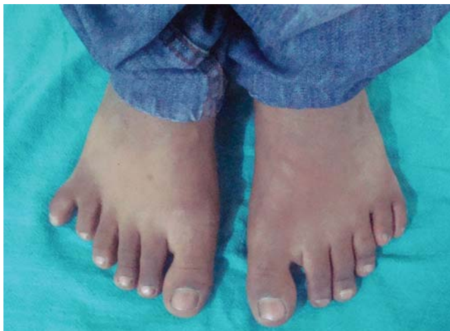
Fig. 3: Polydactyly in both feet