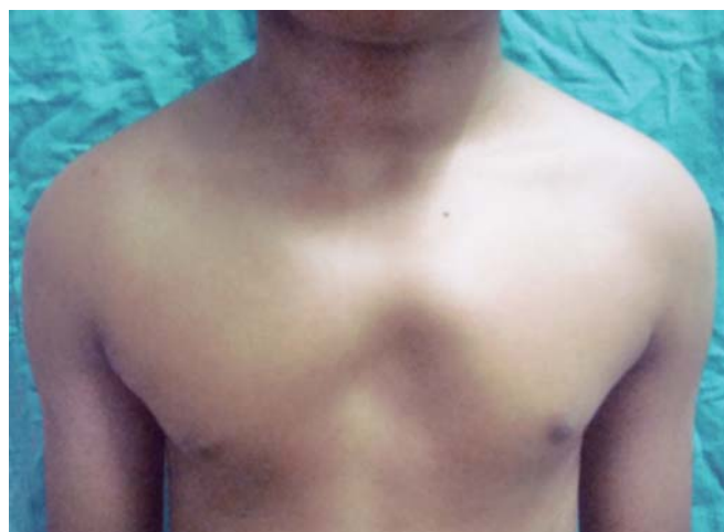
Fig. 4: Pectus excavatum