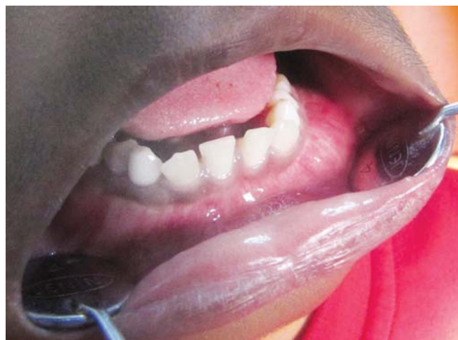
Fig. 1: Intraoral view showing buccal swelling in mandible

An 11-year-old child presented with pain in the lower jaw since 20 days. On extraoral examination there was very mild swelling in the left side angle of mandible. During intraoral examination there was buccal and lingual cortical expansion in the lower left jaw in relation to mandibular left canine, deciduous first and second molar (Fig. 1). Panoramic radiograph (Fig. 2) revealed multiple radiolucencies with scalloped border around unerupted right canine, left first premolar, right first and second premolars. Radiolucencies circumscribing mandibular second and third molar, notching the coronoid and condylar process on both side of the mandible are also evident. The mandibular left canine bud was missing. Multiple cystic spaces were clinically mimicking dentigerous cyst.