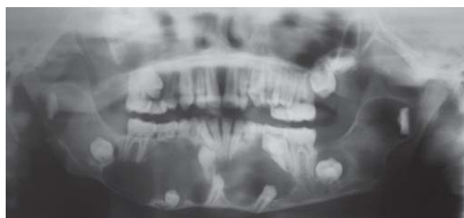
Fig. 2: Panoramic radiograph