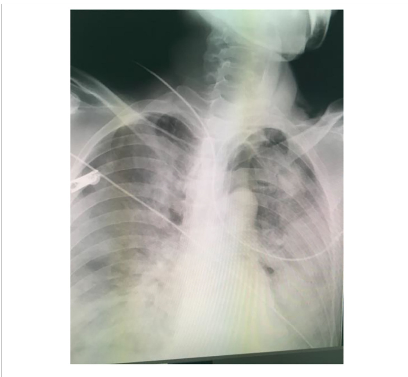
FIGURE 1 | Chest x-ray revealed pulmonary edema with fluid-filled bilateral lungs.

(APTT) at designated levels (usually 1.5 times the normal values for the APTT measurement system). Hemoglobin levels, blood platelet counts, and lactic acid accumulation were regularly detected to monitor the development of complications. The rest settings during ECMO support were: Ppeak 20–25 cmH<sub>2</sub>O, PEEP 10–15 cmH<sub>2</sub>O, RR 10 bpm, and FiO<sub>2</sub> 0.4.