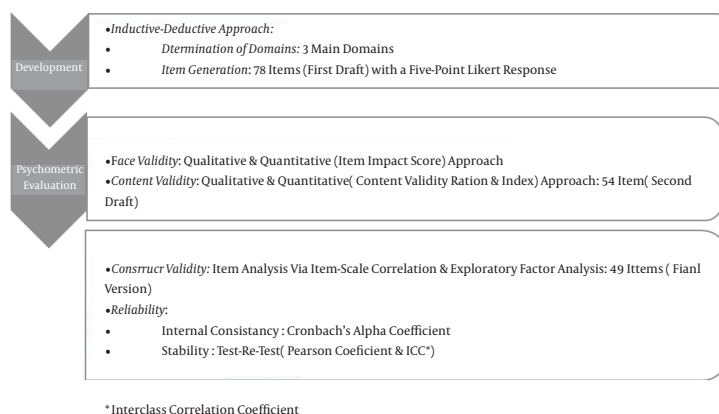
Figure 1. Development and Psychometric Evaluation of the AIMI-IBC (Adjustment to Illness Measurement Inventory)

version of AIMI-IBC (Table 4). Furthermore, the scree plot suggested ten factors should be extracted as Eigen values greater than one. The scree plot (Figure 2) shows the variances explained by each factor in the factor analysis and determine the number of factors to retain. It should be noted that none of the concepts and categories were removed, but merged in the similar clusters as the components of the scale.