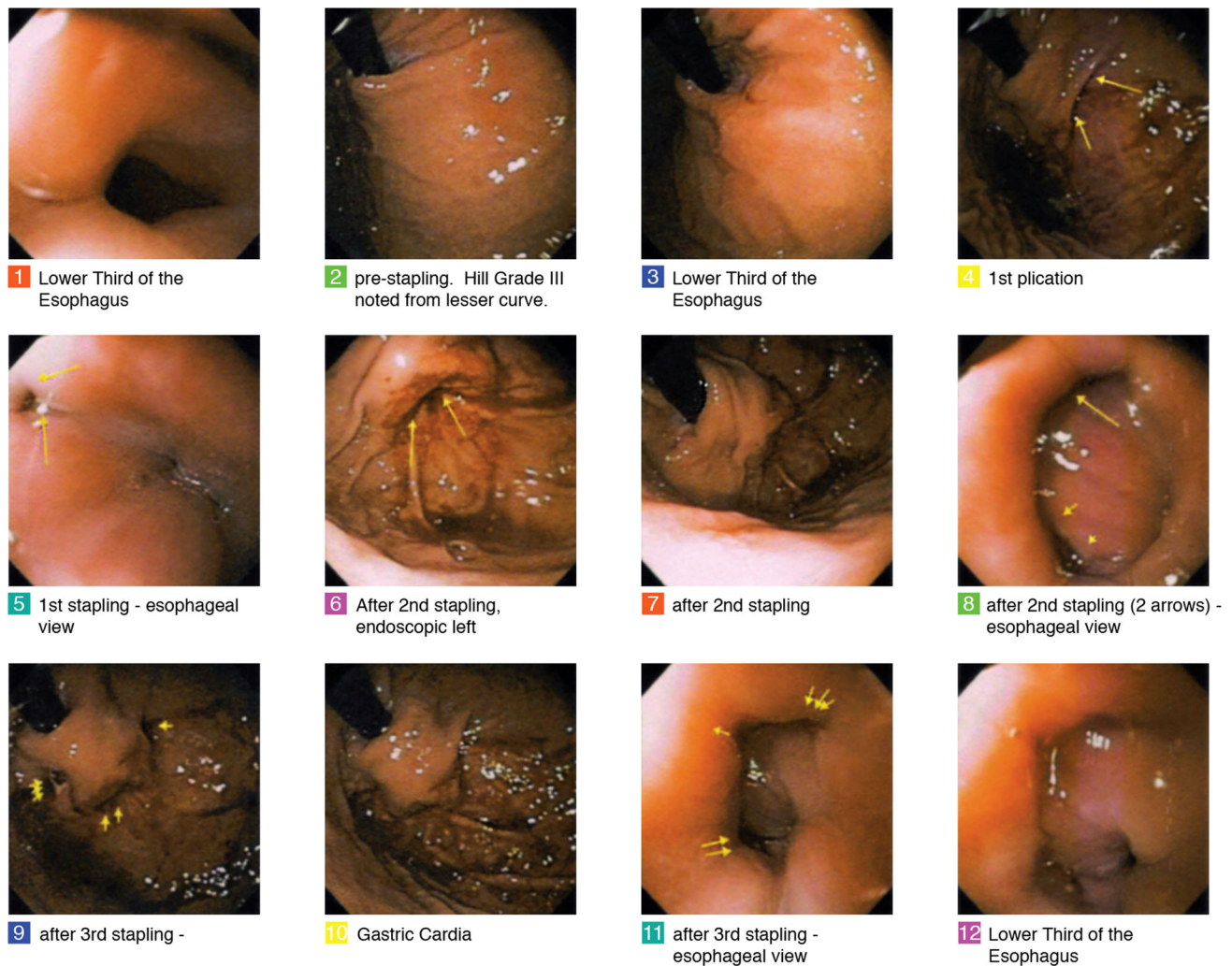
Fig. 2 Step by step endoscopic images of a procedure involving the placement of three quintuplets of staples (15 staples total) to create an effective gastroesophageal flap valve

If a sliding hiatal hernia (SHH) was identified, ventilation with positive end expiratory pressure (PEEP) of 5 mmHg (6.8 cm H 2 O) was applied, and gradually increased to 10 mmHg (13.6 cm H 2 O) to reduce the stomach into the abdominal cavity. After the first 24 cases, the protocol was amended to reduce the pressure gradient between the abdominal and the thoracic cavity in order to prevent air leaks around the screws. Subsequently, all subjects were ventilated with a PEEP setting of 5 mmHg, after the orotracheal intubation. If SHH was still evident, PEEP was gradually increased to 10 mmHg until the hernia was reduced.