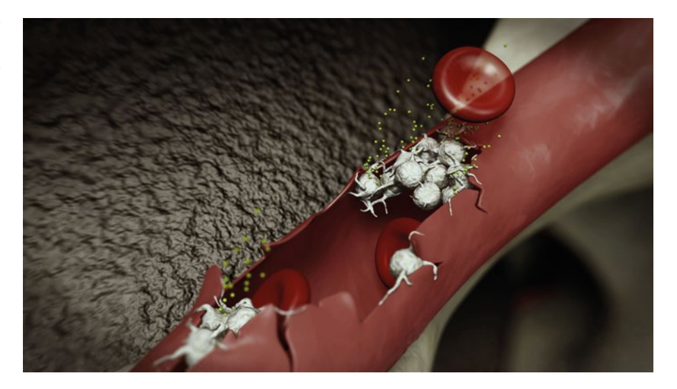
Fig. 1 Platelet aggregation at a ruptured vessel, following implant insertion. Implant surface is shown in the background.<sup>2,3</sup>

It is important that students and practitioners understand the complex interplay between the cascade of underpinning biological processes and clinical manifestations of those interactions. This opens the door for computer-animated films. A clinical course of treatment can be simulated by means of a film where cellular and even molecular effects can be visualised in a way that has both clarity and the ability to engage all three levels of human tissue structure and function as a continuum. To this end, modern techniques of video animation were used for a computeranimated film on the osseointegration of dental implants, complications of those implants and their management, so that students could gain a visual understanding of the interaction between biomaterials and tissues, in a way that could easily be explained in words or by static diagrams, or via a traditional film. A major advantage of a computer-animated film is the possibility of describing not only interactions between cells and biomaterials at single points in time (for example, osteoblasts on implant surfaces) but also the interactions along a time