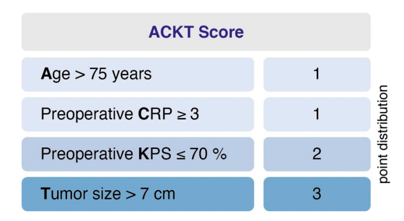
Figure 2. A clinical score to preoperatively estimate the risk of PMV occurrence in geriatric meningioma patients. An additive value of <3 implies a probability of 98% for not developing postoperative PMV. PMV, prolonged mechanical ventilation.

Further, we designed and evaluated a prediction score for PMV. The score was designed (1) to predict PMV based on easily identifiable and routinely recorded preoperative variables and (2) to be easy to calculate and implement. This yielded the following point distribution for a new score, which we called the "ACKT" score, ranging from 0 to 7 (Figure 2): age > 75 years (1 point); preoperative C-reactive protein (CRP) value \geq 3 (1 point); preoperative KPS \leq 70% (2 points); tumor size > 7 cm (3 points). In the present series, the mean score in patients with PMV was 3.7 (SD = 1.8) and 1.3 (SD = 1.2) in patients without PMV. Using a cut-off point of 3, the score yields a sensitivity of 73.3%, a specificity of 83.6%, a positive predictive value of 22.3% and a negative predictive value of 98%. An additive value of < 3 implies a probability of 98% for not developing postoperative PMV. Furthermore, the scoring system enables us to preoperatively demask 73% of patients that will suffer from PMV after intracranial meningioma resection.