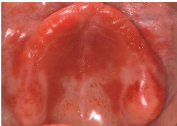
FIGURE 1- Overgrowth of the tuberosities

When the signs were grouped together into three