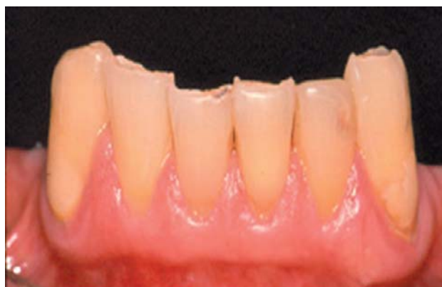
FIGURE 3- Extrusion of the mandibular anterior teeth