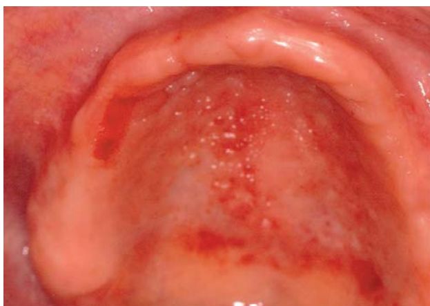
FIGURE 2- Papillary hyperplasia in the hard palate