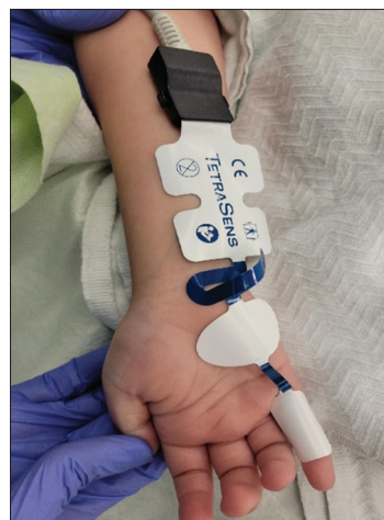
Figure 1: The TetraGraph™ electromyograph monitor with attached electrodes

Outcomes and statistical analysis: The primary endpoint evaluated the efficacy and feasibility of using the TetraGraph™ EMG monitor in pediatric patients weighing 20 to 60 kg. The device recorded the TOF ratio, the TOF counts, post-tetanic count (PTC), and responses during maintenance of block and block recovery with sugammadex throughout surgery at 20-s intervals until after tracheal extubation. Data from the built-in secure digital memory card from the TetraGraph™ were retrieved and analyzed. As a secondary aim, we also evaluated the feasibility of EMG monitoring with the TetraGraph™ in laparoscopic surgical settings (e.g., we tested the ability of the device to record and display TOF data throughout the surgical procedure in which the patient's arms were tucked under surgical drapes) by measuring the number of failures of reporting neuromuscular data among the cohort.