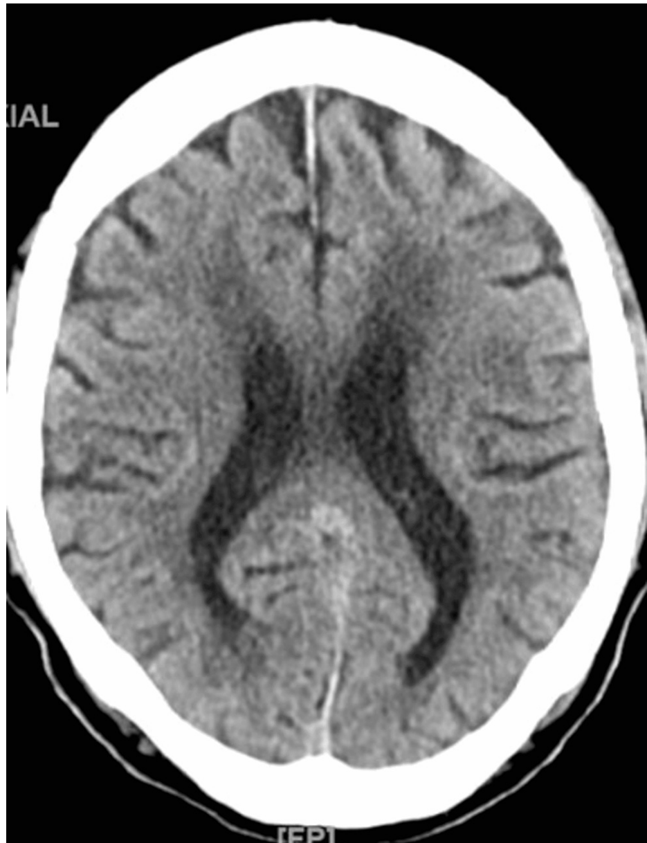
FIGURE 2: CT head showing bilateral white matter hypodensities compatible with chronic ischemic/degenerative changes, cerebral and cerebellar volume loss, and no acute stroke or evidence of hemorrhage, chronic lacunar infarct in right periventricular white matter is noted measuring up to 6 mm.