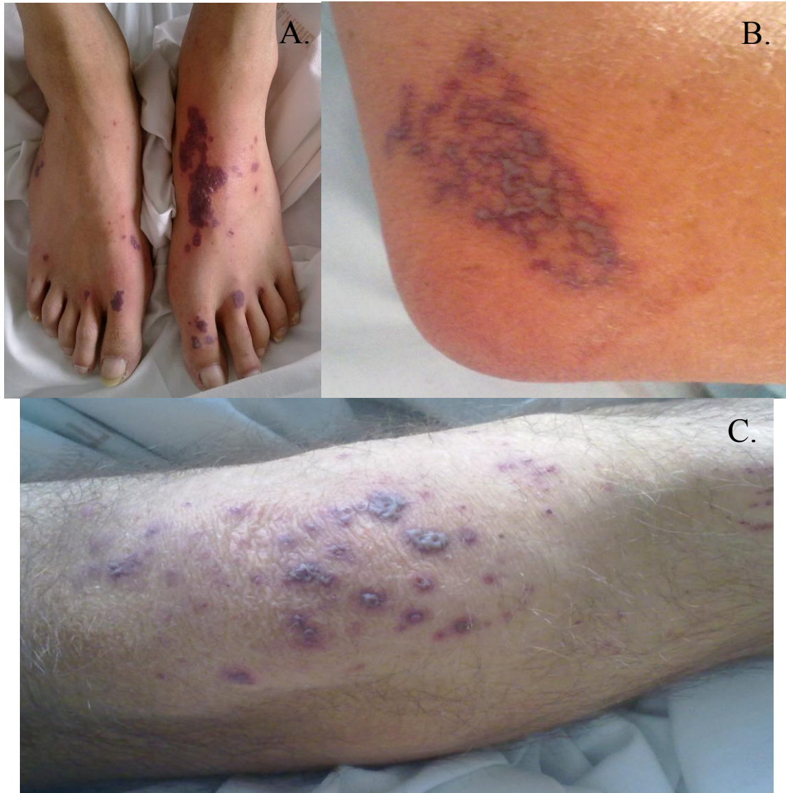
Figure 2 Image of the first necrotic purpura eruption on the feet (A), elbows (B), and knees (C).

echocardiograph showed no signs of endocarditis. Blood cultures, urine analysis, as well as polymerase chain reaction testing for herpes simplex virus 1 (HSV1), HSV2, and varicella zoster virus (VZV), and serology for HSV1, HSV2, VZV, Epstein-Barr virus (EBV), human herpesvirus 6 (HHV6), human herpesvirus 8 (HHV8), cytomegalovirus (CMV), hepatitis B virus (HBV), hepatitis C virus (HCV), human immunodeficiency virus (HIV), parvovirus B19, rickettsia, and Lyme disease, did not show any evidence of recent viral, bacterial, or fungal infections. Differential diagnostic investigations included tests for anti-nuclear antibodies, cryoglobulin, cryofibrinogen, complement dosage, protein electrophoresis, immunoglobulin dosage;