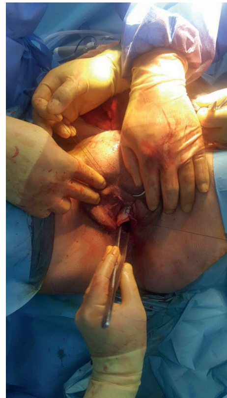
FIGURE 4: Repair of the vaginal defect with primary sutures.

the complaint of prolapsed intestines from the vagina 12 months after the repair of the perineal hernia. During the examination, the small intestines were observed to be freely prolapsed from the vagina and several local ischemic changes were detected (Figure 3). In the emergency laparotomy, the terminal ileum revealed a herniation out of the