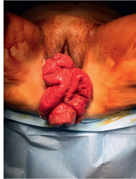
FIGURE 3: Vaginal eversion of the small bowels.

The patient had no complaints related to the perineal hernia during the follow-up using CT imaging (Figure 2). The patient who was followed in the oncology clinic without problem was admitted to the emergency department with