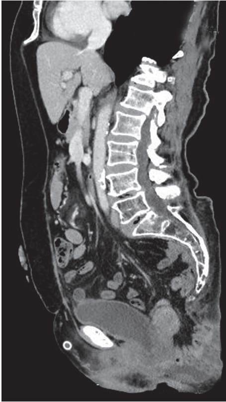
FIGURE 1: Herniated small bowel segments through the pelvis in CT scan.