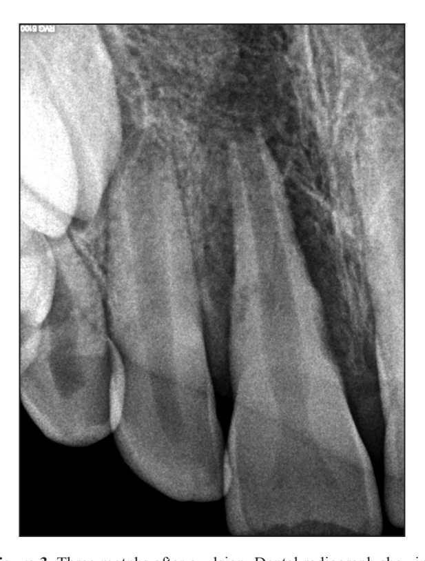
Figure 3. Three moths after avulsion. Dental radiograph showing severe external resorption and periapical lesion of tooth #11.