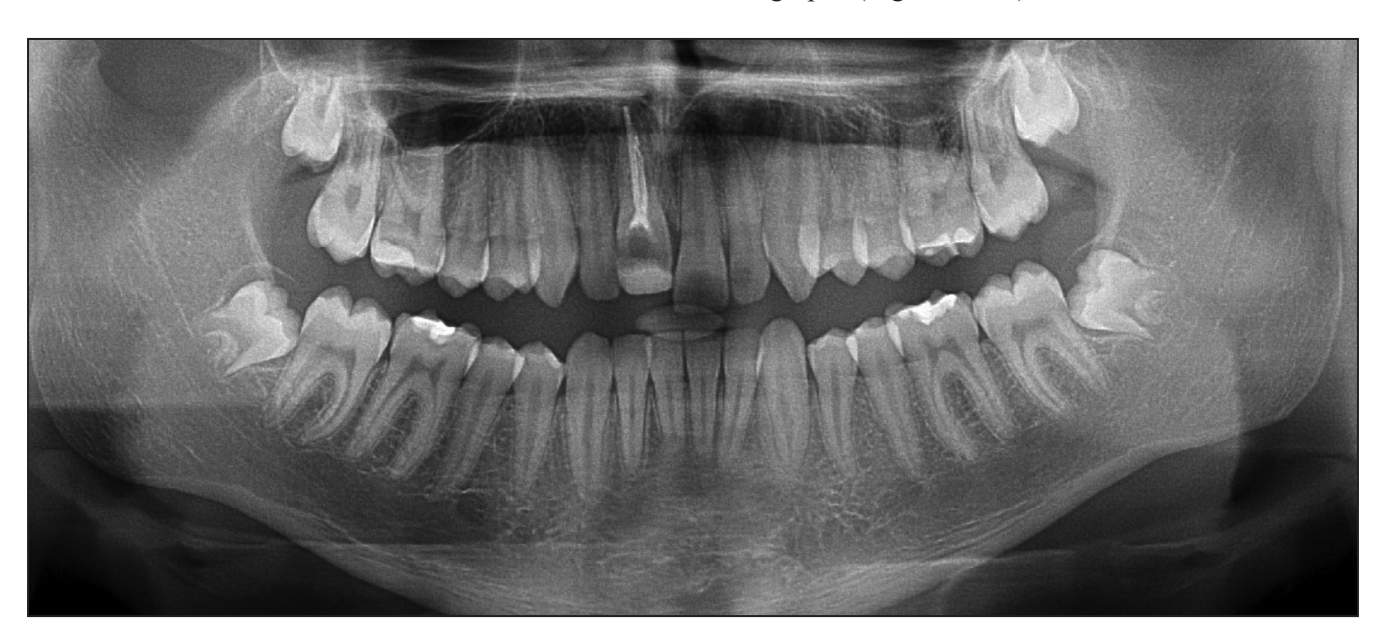
Figure 5. Seven-year follow-up of replanted tooth. Panoramic radiograph showing infra-occlusal position of tooth #11.

Clinical findings of last (six years after trauma) checkup were infra-occlusal position of tooth #11, mild discoloration of crown, no mobility, no sensitivity to percussion and palpation. Ankylosis of tooth was observed in both panoramic and control periapical radiographs (Figures 4 - 6).