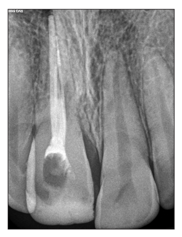
Figure 4. At 7-year follow-up period. Dental radiograph showing no resorption; infra-occlusal position of tooth #11 is observed.

The access cavity was prepared using a diamond round bur with irrigation. Necrotic pulp was extirpated from root canal. Working length was determined with an apex locator with the use of #60 K-file (Maillefer Instruments SA, Ballaiques, Switzerland). The decontamination protocol included slow and careful irrigation with 2.5% Sodium hypochlorite (NaOCl) solution. The root canal was dried with large paper points and then filled