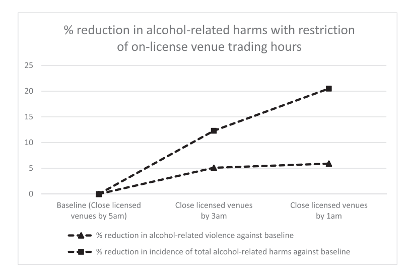
Figure I Impact of early closing of on-licence venues

The modelled effects of an extension of bottle shop (offlicense) closing times to 11 pm across NSW in 2017 are presented in Table 1. This scenario resulted in an increase in harms across the full range of indicators, including a 5.1 \pm 0.8 % increase in alcohol-related violence between 2017 and the end of 2021. Compared to the baseline, this scenario produced the greatest impact for females consuming alcohol at heavy and moderate levels ( 10.7 \pm 7.0 % and 8.2 \pm 6.2 % increase in the incidence of acute alcohol-related harms respectively) and males consuming alcohol at moderate levels (a 10.4 \pm 6.7 % increase in acute harms).