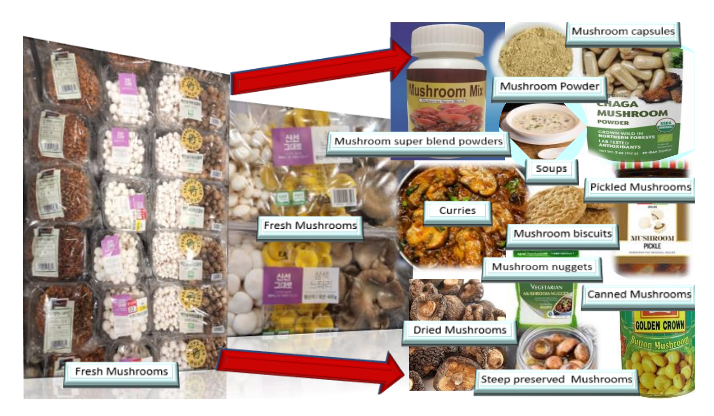
Figure 3. Nutritionally rich mushroom-based foods.