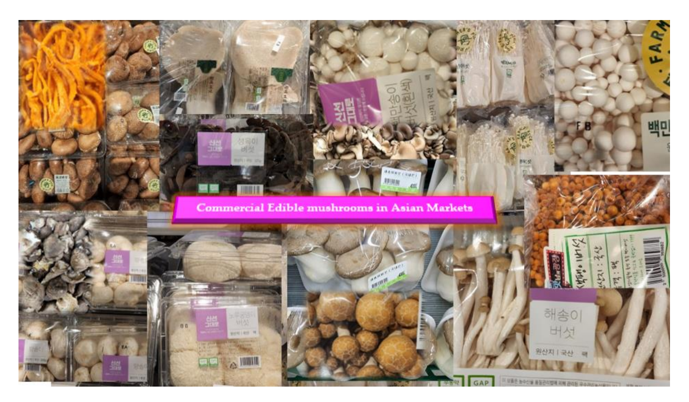
Figure 1. Overview of the various edible mushroom varieties in the Korean market.

With wheat, rice and maize being the staple food of a vast majority of the global population, there is a marked deficit of protein in our diets. Supplementation of mushrooms bridges the protein gap and improves nutrition and wellbeing of socially and economically backward communities. In the past, mushrooms were categorized as expensive/exotic vegetable types, and consumed only by the elite. Nowadays, thanks to the increasing awareness, these are made available through local mushroom farmers to the general public. Mushrooms hold holistic nutrition, suitable for all age groups. The nutritional value of mushrooms is strongly influenced with respect to the species, stage of development and environmental conditions. Mushrooms contain surplus protein, dietary fiber, vitamins and minerals, as well as starches, pentoses, hexoses, disaccharides, amino sugars, sugar alcohols and sugar acids. The carbohydrate content of mushrooms ranges from 26 to 82%. Their crude fiber is made up of partially digestible polysaccharides and chitin. Mushrooms commonly have low lipid levels, yet they contain polyunsaturated fatty acids in large proportions. Thus, they have low calorific yields and no cholesterol. They also contain ergosterol (Vit-D precursor), proving to be highly advantageous [1,8–11]. Figure 2 shows a few representative chemical structures of bioactive moieties in edible mushrooms.