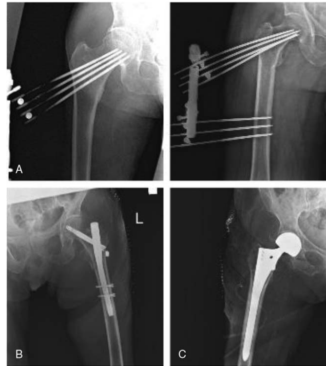
Figure 1. Postoperative X-ray images; (A): External Fixation, (B): PFN, (C): Hemiarthroplasty.

The patients were operated under peripheral block, short-term spinal anesthesia or mild sedation after evaluation by the Anesthesiology and Reanimation Department. Dyna EXTOR II (BK Meditech -Korea) fixators, which allow to send multidirectional angular nails on the traction table, were used in Group I