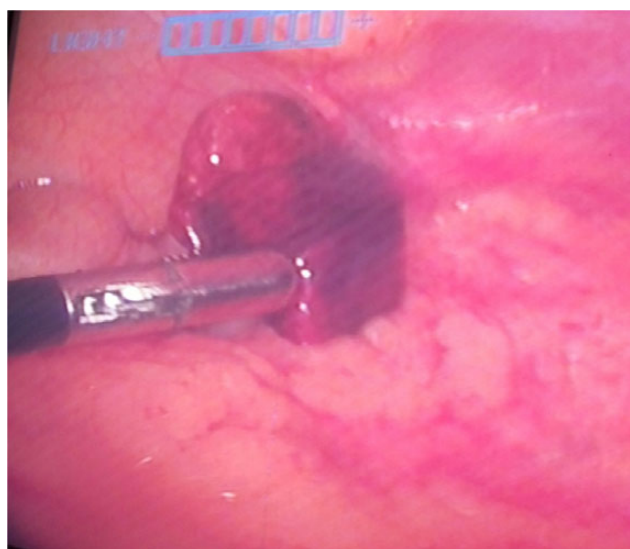
Figure 2: Intraoperative image showing tortuous ischemic parietal peritoneum lipoma in RIF.

Lipoma is the most common benign form of soft tissue tumor composed of adipose tissue. Lipomas are generally soft to touch, usually movable and painless. Approximately 1% of the general population has a lipoma. One percent of lipoma has a tendency for malignant transformation and is more likely in lesions of lower extremities, shoulders and retroperitoneal areas.