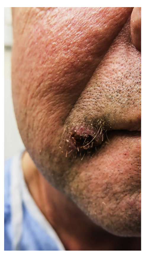
Fig 1. Cutaneous Emmonsia species ulcerated nodule at the right oral commissure in a Canadian renal transplant recipient.