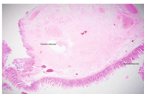
FIGURE 2: Low microphotograph of the jejunum showing an island of gastric mucosa in the center.