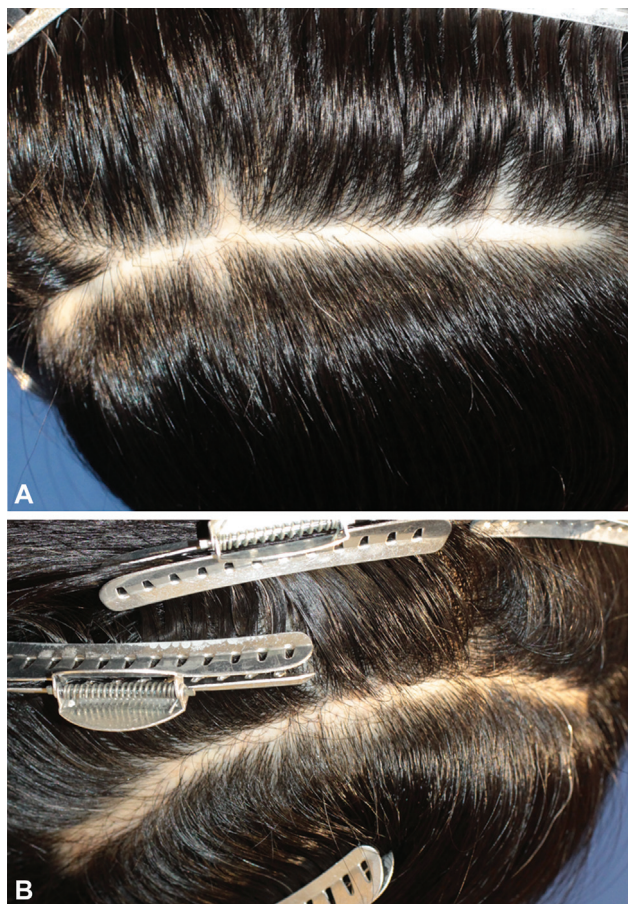
Fig. 4 (A) The example picture of patients who achieved poor result. Preoperative view. (B) One year after the operation of A. The intraoperative density was 14 cm 2 .

FUE is useful for the treatment of scar alopecia after craniotomy. Our results suggest that the 1-year postoperative hair density should exceed 20 FU/cm 2 to achieve good outcomes.