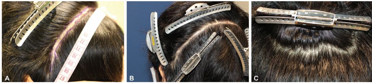
Fig. 3 (A) Preoperative view of case no. 3. The patient received coronal incision due to Crouzon disease 14 years ago. He was referred to our clinic because a 22.0 \times 0.5 cm mature scar was left on his scalp. Two hundred and fifty follicular units were transferred to the scar ( 22.3 \text{ FU/cm}^2 ). (B) One year after the operation of case no. 3. The survival rate of the grafted follicular units (FUs) was 70%. The patient did not feel any improvement in the external appearance. We categorized his postoperative result as fair. (C) The donor site of case no. 3. Scar was not visible. Even after brushing his hair.

patient did not feel that the external appearance had improved (►Fig. 3B). We categorized his postoperative result as fair.