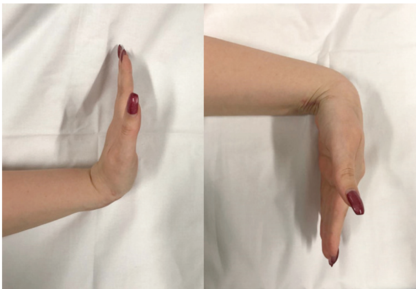
Figure 3. Wrist range of motion at 3 months follow-up

results in few weeks but using conventional stainless-steel radial plate will not permit good images at MRI follow-up. The great advantage of Carbon-Peek plate fixation devices is that guarantees low impact on MRI images quality allowing MRI follow-up until T2-weighted signal intensity normalization was obtained.