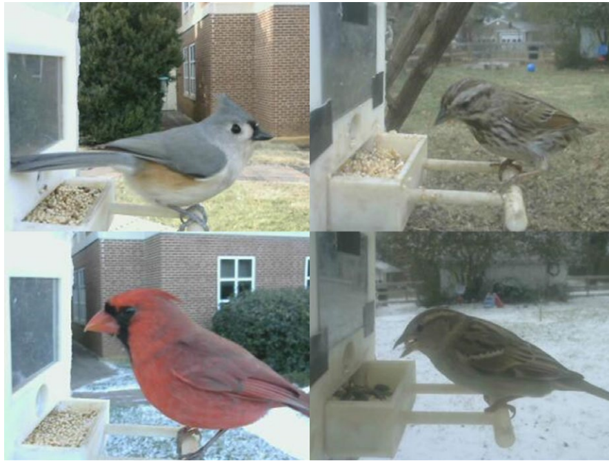
FIGURE A1 View from our PASSER smart feeder's camera. Top left: Eastern tufted titmice ( Baeolophus bicolor ) at the campus feeder. Bottom left: Male northern cardinal ( Cardinalis cardinalis ) at the campus feeder. Top right: Song sparrow ( Melospiza melodia ) at the Residential Feeder. Bottom Right: Female house sparrow ( Passer domesticus ) at the residential feeder