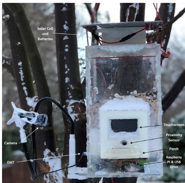
FIGURE 1 The PASSER smart feeder with key components labeled

We placed feeders at three sites (Campus, Residential, and Conservancy) all within a 2.88 km radius in southwest Virginia's New River Valley. Each site was assessed for level of anthropogenic disturbance (Table 1). We quantified disturbance using three metrics: percent of total area comprised of green space, local human population density, and frequency of human traffic within 25 m of the feeder. Percent green space was calculated within a 250 m radius of each feeder using satellite images from Google Earth Pro (Google, Mountain View, USA). Images were analyzed in ImageJ (NIH, Rockville, USA) to calculate the total area of green space (vegetation, unpaved ground, and small areas of water) versus built space (buildings and paved areas such as sidewalks and parking lots). We calculated local human population density using population totals from the census block groups that feeders were located within (Data Access and Dissemination Systems, 2010), divided by the areas of these block groups (determined using 2010 US census maps and Image J; Data Access and Dissemination Systems, 2010). To quantify human traffic frequency, an observer recorded the number of people and motor vehicles passing within 25 m of the feeder during a 30-min period. People or vehicles that loitered within 25 m of the feeder were counted once per minute to incorporate their continued presence into the data set. Observations were repeated at each site