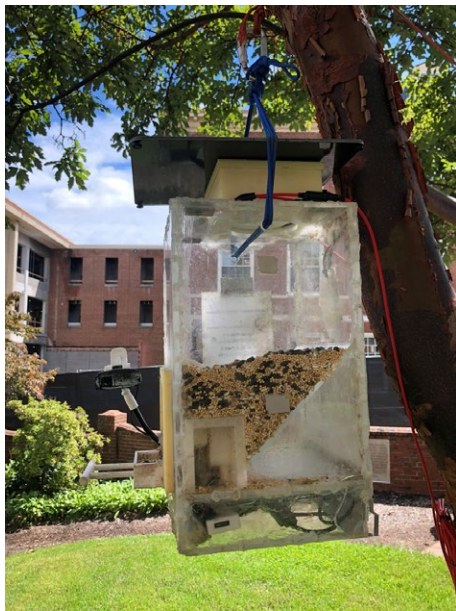
FIGURE A2 A side view of our PASSER smart feeder at the campus location

Computer: Raspberry Pi Zero - Version 1.3 with Raspbian operation system (8 GB SD Card w/ Stretch Lite; Product ID: 2820; Raspberry Pi, Cambridge, UK; Adafruit Industries, New York, USA)