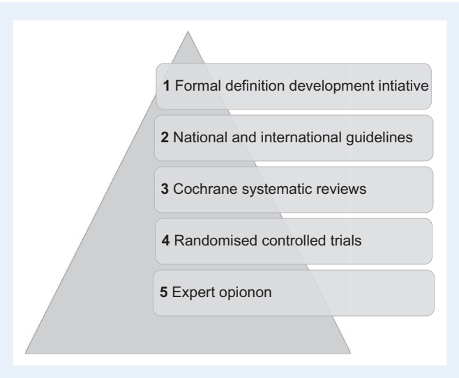
Figure 2 Definition hierarchy: a framework for evaluating potential definitions for individual core outcomes.

The Standard Protocol Items: Recommendations for Interventional Trials (SPIRIT) statement, implemented by funders of health research including the National Institutes of Health, European Commission, and the National Institute of Health Research, recommend the use of