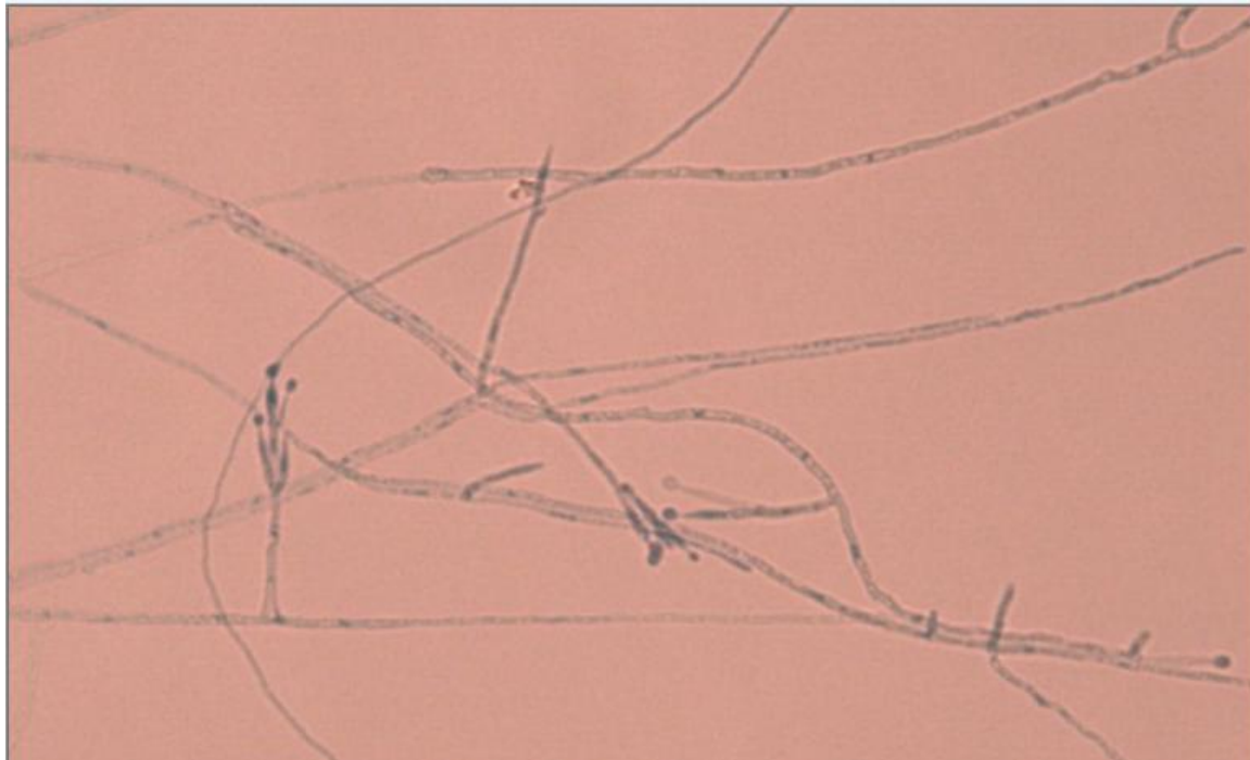
Figure 3 Septate hyaline hyphae, conidiophores, phialides, conidia, and chlamydospores. Conidiophores (3 to 4 \mu\text{m} wide and 400 to 600 \mu\text{m} long) are branched and carry the phialides at their tips. The phialides are swollen at their bases and taper toward their apices.

keeping with fungal infection (Figure 1). She underwent endoscopic sinus surgery and clearance of the collection. A microbiology specimen isolated Staphylococcus aureus . Histology revealed numerous fungal hyphae.