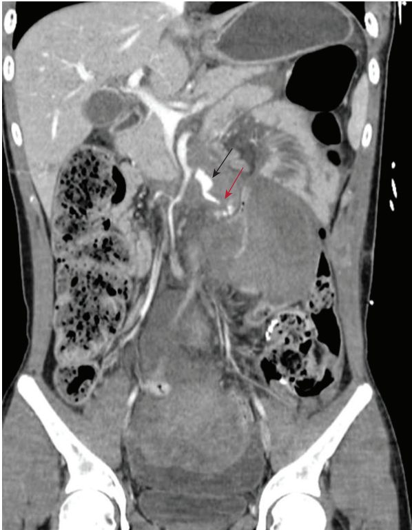
Figure 2. Coronal intravenous contrast enhanced computed tomography through the superior mesenteric artery (SMA) demonstrates pseudoaneurysm (black arrow) arising from the SMA at the origin of a jejunal branch artery. The red arrow highlights a focus of active extravasation from inferior margin pseudoaneurysm. Note the large surrounding mesenteric haematoma and pelvic haemoperitoneum.

Several reports exist in the adult literature regarding successful endovascular management by transcatheter embolisation or stent graft placement in the management of selected cases with low complication rates. 8–10 The goal of endovascular therapy is to stop the active haemorrhage, limit the formation of haematoma, and possibly avoid surgery. 8–10 The known complications of endovascular therapy include rebleeding, non-target embolisation or migration of embolic material, acute bowel ischaemia, chronic bowel stricture, and contrast related renal failure.