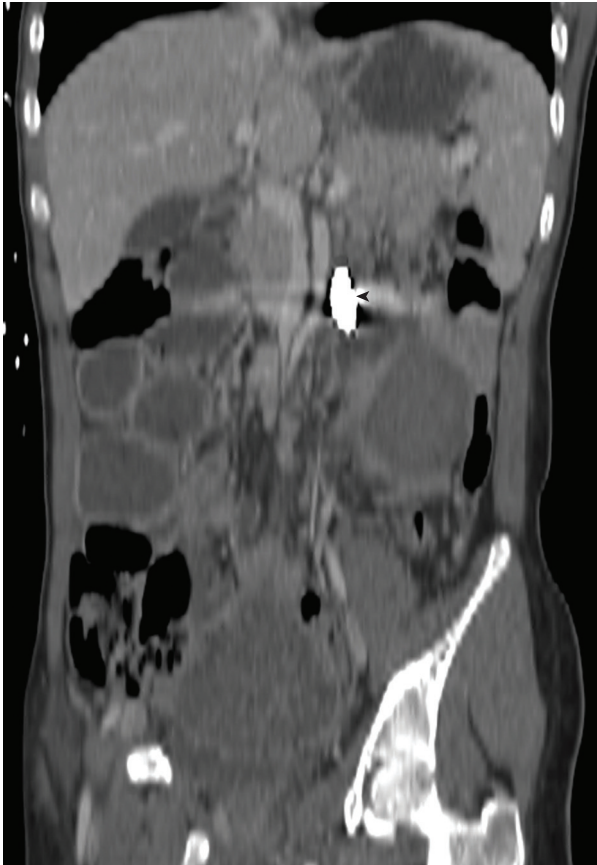
Figure 4. Coronal intravenous contrast enhanced computed tomography through the superior mesenteric artery (SMA) performed four weeks post-embolisation demonstrates embolised pseudoaneurysm coil pack (black arrowhead) and patent adjacent SMA.

sac microcatheterisation, and reduced risk of covering or excluding the origin of adjacent jejunal artery branches compromising bowel perfusion. Owing to the previous small and large bowel resections, there was concern that stent grafting could compromise perfusion to other segments of bowel as normal collateral pathways may have ligated. Stent grafts were available at time of the procedure should embolisation have been technically suboptimal.