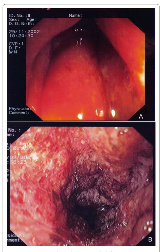
Figure 1 A. Congested rectal mucosa with diffuse erythema in a case of grade I radiation colitis (RTOG/EORTC late radiation morbidity scale for large intestine). B. Ulcerated rectal mucosa with diffuse erythema, mucous and intermittent bleeding in a case of grade II radiation colitis (RTOG/EORTC late radiation morbidity scale for large intestine).