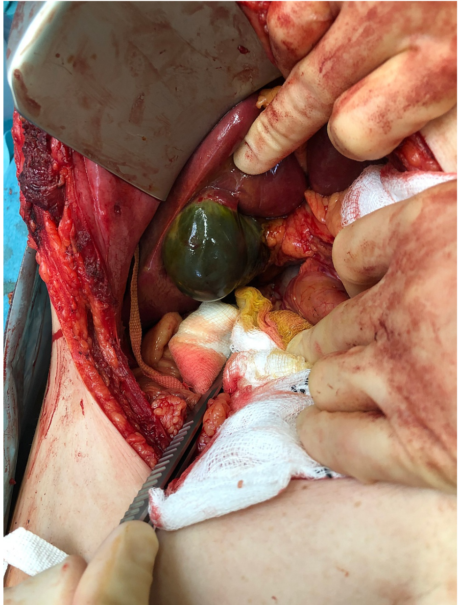
FIGURE 2: Gallbladder wall stained and leaking bile