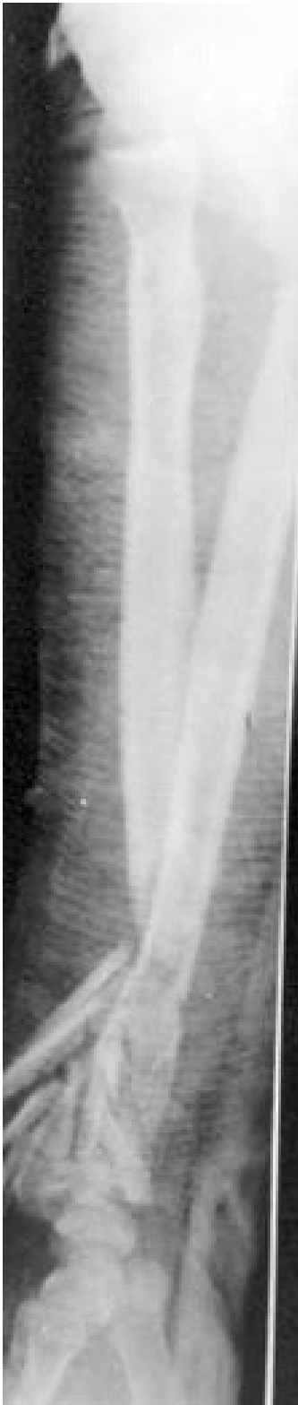
Figure 2 Lateral radiographs of his left forearm and wrist revealed the describing injury.