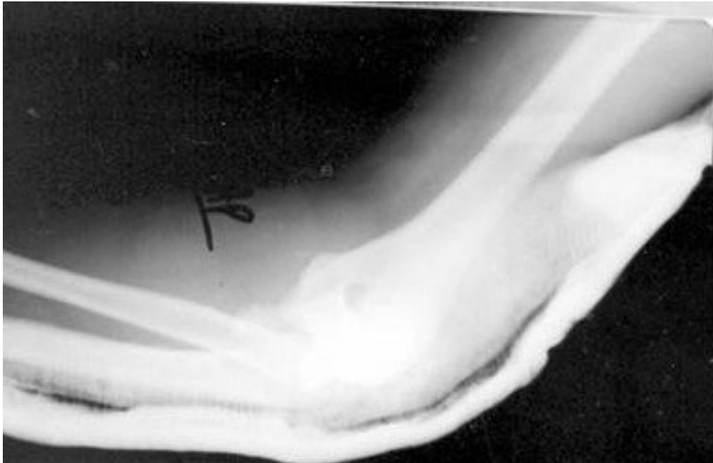
Figure 3 Lateral radiographs of his left elbow showed the Monteggia fracture dislocation.

ative hypoxia especially of the multiply injured patients has the potential to delay soft tissue healing and provides a susceptibility to infection. In our series 3 patients were