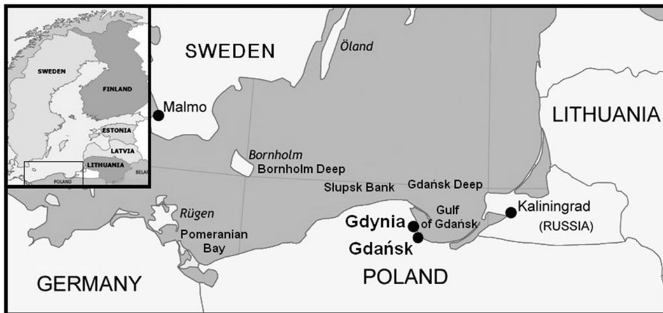
Fig. 1 The southern Baltic Sea