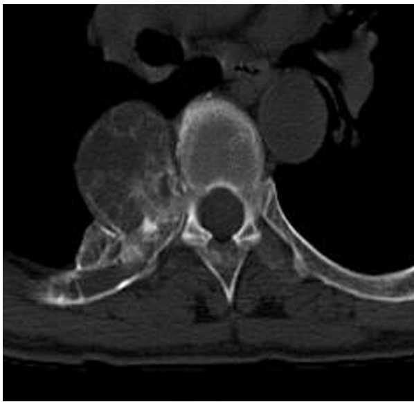
Figure 1 CT reveals a lytic lesion in right fifth posterior rib with ossified matrix.

clinic history, the initial imaging impression was osteochondroma.