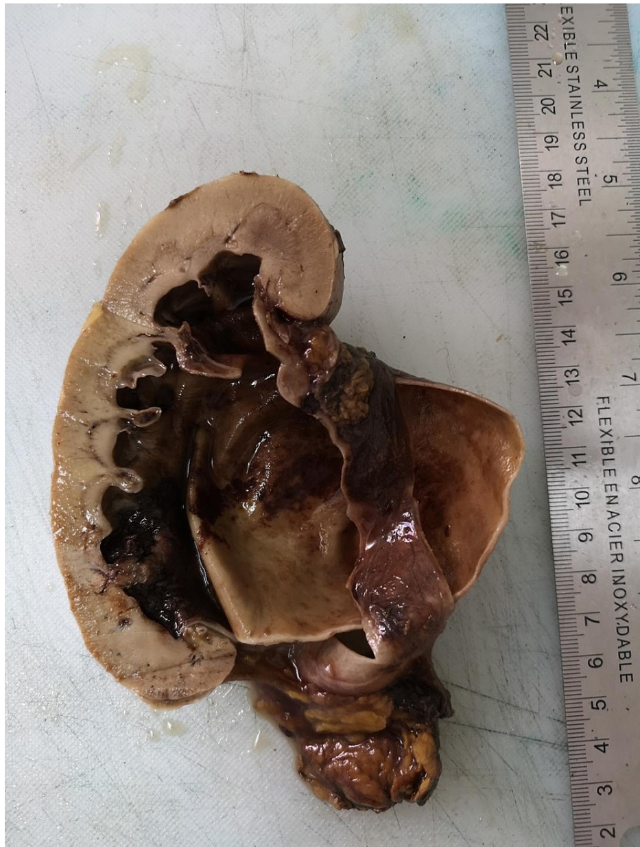
FIGURE 3: Gross section of the specimen demonstrating massively dilated renal pelvis.

Additionally, the histological section showed no underlying malignancy or readily apparent source of the hematoma except for a large vein which ruptured into the renal pelvis (Figure 4).