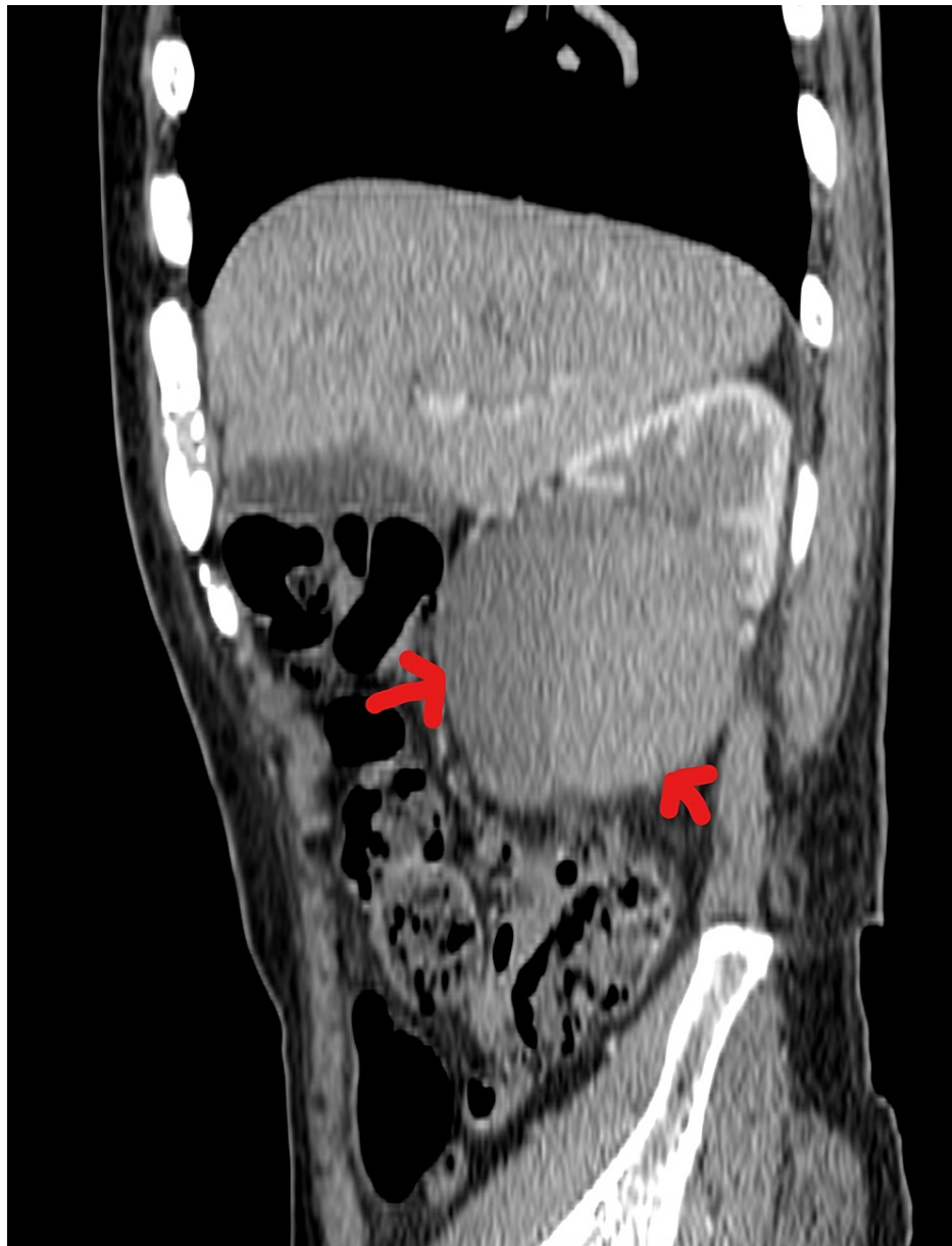
FIGURE 2: Non-contrast CT scan (sagittal view) through the level of the right kidney showing a large hematoma contained by a massively dilated renal pelvis (red arrows).

The patient's blood pressure remained labile despite fluid resuscitation and an open right nephrectomy was performed utilizing a transperitoneal, subcostal approach. Given the potential for an underlying transitional cell carcinoma, cystoscopy was carried out at the time of nephrectomy, with no intravesical lesions noted. At nephrectomy, the hematoma was contained by a grossly dilated renal pelvis and the procedure was otherwise uneventful. Pathologic examination of the excised renal unit confirmed UPJO (Figure 3).