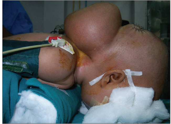
Figure 1: Prone position in a 10-month-old child with occipital encephalocele

be complicated by mid cervical flexion myelopathy and macroglossia. Lateral position is rarely used in paediatric patients with ipsilateral posterior lesions or cerebellopontine angle tumours [Figure 3].