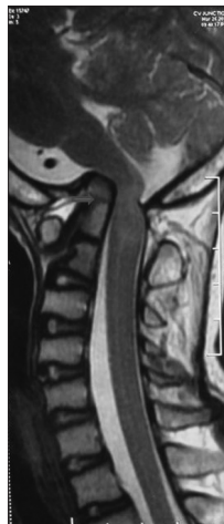
Figure 6: T 2 -weighted magnetic resonance imaging of cervico-medullary junction shows basilar invagination (arrow)

Craniovertebral junction (CVJ) anomalies are developmental disorders that affect the skeleton and enclosed neuraxis at the junction of cranium and cervical spine. The clinical syndromes associated with these anomalies are attributable to the following: (i) pressure on the neuraxis by the bony abnormalities, (ii) intrinsic malformations of the nervous system and (iii) disturbance of the CSF circulation and blood supply. [33] The bony abnormalities usually encountered in CVJ anomalies are basilar invagination, occipitalisation and congenital atlanto-axial dislocation. The clinical manifestations may occur because of direct compression of the neural tissue by these osseous anomalies as the spine is grossly unstable. The patients may present with respiratory dysfunction (restrictive lung disease) owing to compression of the brainstem by odontoid process [Figure 6] of second cervical vertebra affecting the respiratory centre and weakening of the muscles of respiration including diaphragm. [34] The surgical management includes