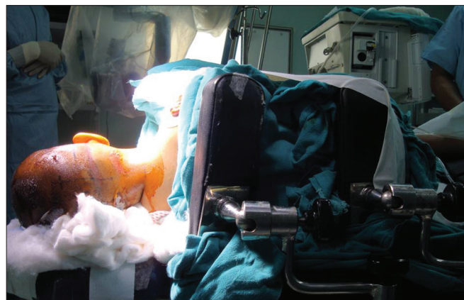
Figure 3: Lateral position in a 2-year-old child undergoing retromastoid suboccipital craniotomy for excision of brainstem glioma