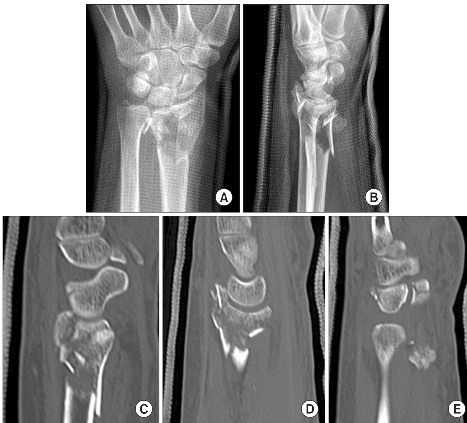
Fig. 5. Initial radiographs (A and B) show a distal radial fracture (AO type C3) and an ulnar styloid fracture. Bony fragments of the distal radial fracture are displaced over the dorsum of the lunate, and a small bony fragment was identified on a lateral radiograph. Reconstructed computed tomography images show a dorsal pole fracture of the scaphoid (C), a cartilage injury of the dorsal pole of the lunate (D), a dorsal cortical fracture of the triquetrum, and a comminuted fracture of the pisiform (E). AO: arbeitsgemeinschaft für osteosynthesen.

CBFs in 20.6% of DRFs that had been surgically treated. However, plain radiographs were insufficient to make a diagnosis, thus most cases were confirmed by CT. Welling et al. 10) suggested that CT should be considered if clinically