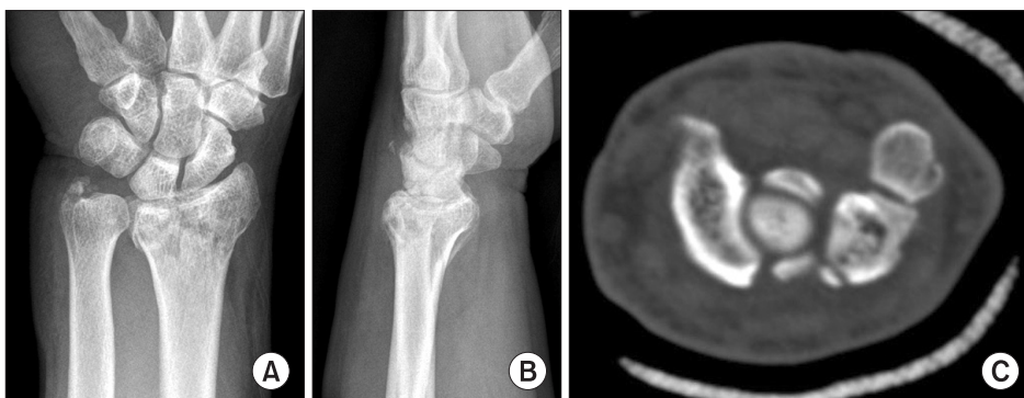
Fig. 3. Initial radiographs (A and B) show a radial fracture (AO type C3) and an ulnar styloid fracture. A small bony fragment was identified on a lateral radiograph. Reconstructed axial computed tomography image (C) shows a dorsal cortical fracture of the triquetrum and a sagittal fracture of the pisiform. AO: arbeitsgemeinschaft für osteosynthesen.