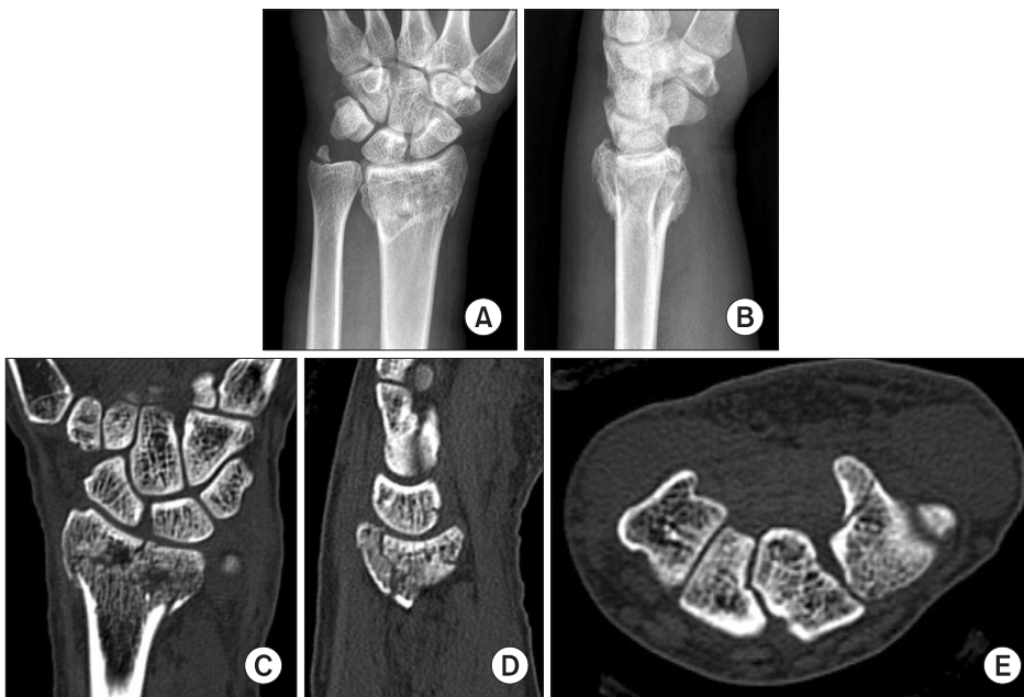
Fig. 4. Initial radiographs (A and B) show a distal radial fracture (AO type C3) and an ulnar styloid fracture. However, no carpal bone fracture is shown on simple radiographs. Reconstructed computed tomography images show fractures of the scaphoid waist (C), palmar pole of the lunate (D), and the hook of the hamate (E). AO: arbeitsgemeinschaft für osteosynthesen.