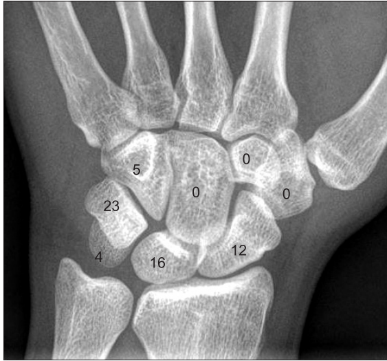
Fig. 1. The distribution of carpal bone fractures that occurred simultaneously with distal radial fractures.

in two of 44 cases, type B1 was complicated in two of 11, type B3 was one of 12, type C1 was one of 13, type C2 was 19 of 75, and type C3 was 21 of 66.