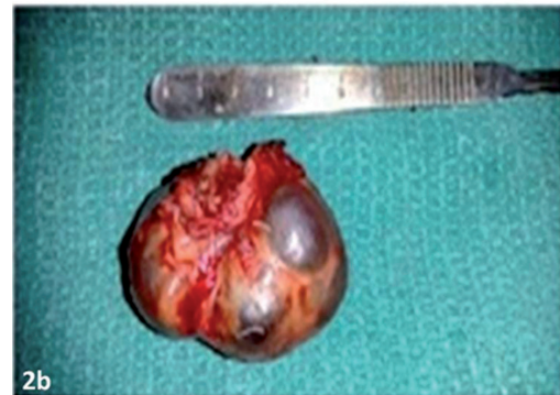
Fig. 2: a,b) Excised lesion in toto.

a well defined altered signal intensity soft tissue mass lesion involving the floor of the mouth with extension into the submental region displacing the left submandibular gland (Fig. 2a,b). An incisional biopsy was done and histopathology report was suggestive of a ranula. Taking into consideration the clinical presentation, the MRI and the histopathology report, a final diagnosis of plunging ranula was made. Excision of the lesion under general anesthesia was planned. A cervical incision was made, layerwise dissection was done, lesion was identified and excised in toto after releasing the adhesions (Fig. 2a,b). The specimen was subjected to post operative histopathological examination. The post-operative report was consistent with the preoperative report confirming the diagnosis of ranula showing pseudocystic cavity filled with foamy histiocytes, extravasated RBC's (Fig. 3). The patient is disease free after a two- year follow -up.