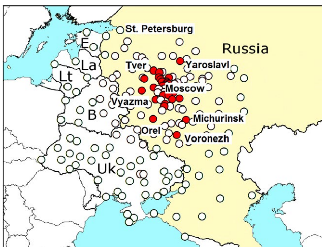
FIGURE 2 Cities and transport hubs of Russia, Belarus, Ukraine, Estonia, Latvia, and Lithuania used as a base for the model for modeling of range of Agrilus planipennis . Red dots—cities, where A. planipennis has been detected. White dots—other cities. B, Belarus; E, Estonia; La, Latvia; Lt, Lithuania; Uk, Ukraine

We have chosen 173 cities and transport hubs of Russia, Belarus, Ukraine, Estonia, Latvia, and Lithuania as a base for the model (Figure 2). The list of these locations with their coordinates is given in Supporting information Appendix S1 (list "Pairwise distances"). The large cities and transport hubs are concentrated near Moscow. Agrilus planipennis is difficult to detect: it often remains unnoticed for several years after the infestation (Siegert, Mercader, & McCullough, 2015). So our models do not calculate the probability of introduction or establishment of the pest in each city, but the probability of detection of A. planipennis if a survey is conducted. This approach allows us to compare calculated probabilities with the data of surveys.