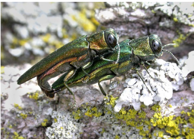
FIGURE 1 Emerald ash borer Agrilus planipennis adults

Emerald ash borer Agrilus planipennis (Coleoptera: Buprestidae) (Figure 1) is native to East Asia and is one of the most destructive forest pest in North America (Herms & McCullough, 2014). In 2003, it was first detected in Europe in Moscow city and then caused great damage to ash trees in 11 regions of Russia (Baranchikov et al., 2008; Straw et al., 2013; Orlova-Bienkowskaja, 2014). This pest poses a