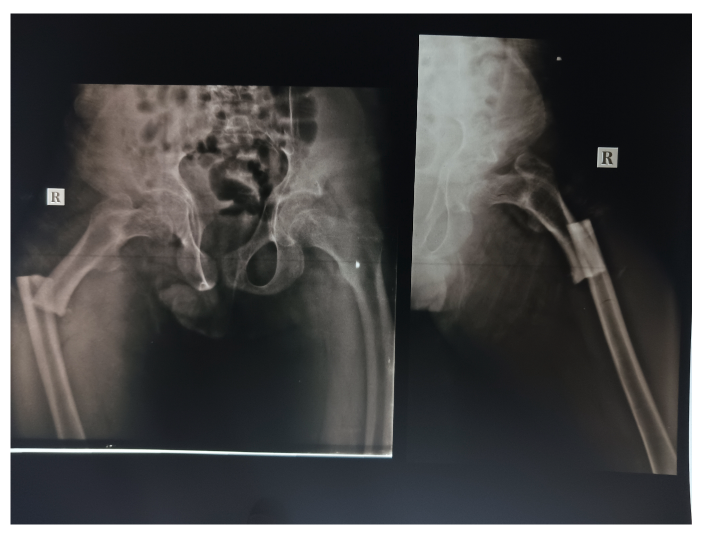
Fig. 1. Skiagram of the right femur showing shaft fracture.

with mean corpuscular volume (MCV) of 76, white blood count of 6700 per millimeter<sup>3</sup> with 49 % neutrophils, 42 % lymphocytes, 3 % eosinophils, 5 % monocytes, and no basophils, platelet count was 3.9 lacs. Serum sodium was 133 mEq/L, and potassium was 5.6 mEq/L. Serum alkaline phosphatase (ALP) level was 279 IU/L, serum calcium was 9.2 mg/dL, serum phosphate was 3.4 mg/dL, and serum 25-hydroxy Vitamin D levels was 34.7 ng/mL. His hormonal profile has been summarized in Table 1. His bone age was between 12 and 14 years [Fig. 3]. In the Dual X-ray Absorptiometry (DXA) scan, the Z-score was (-2.06) and bone mineral density (BMD) was 0.687 g/cm<sup>2</sup> for the lumber, also the Z-score was (-4.07) and BMD was 0.506 g/cm<sup>2</sup> for the left femoral neck.