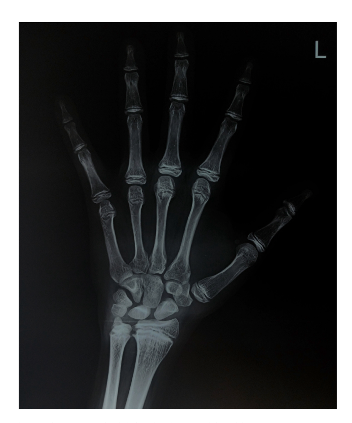
Fig. 3. Skiagram of the left hand indicating delayed bone age in comparison with the patient's chronological age.

Hypopituitarism can occur in association with breech presentation also which is highly prevalent in patients with OI (24–37 %) probably due to large head size and decreased intrauterine movement of the fetus (Cubert et al., 2001). As found in the literature, breech presentation at birth has been associated with pituitary stalk interruption syndrome